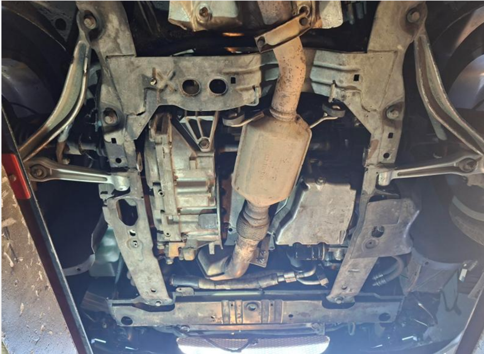
The engine bottom without plastic engine guard plates.