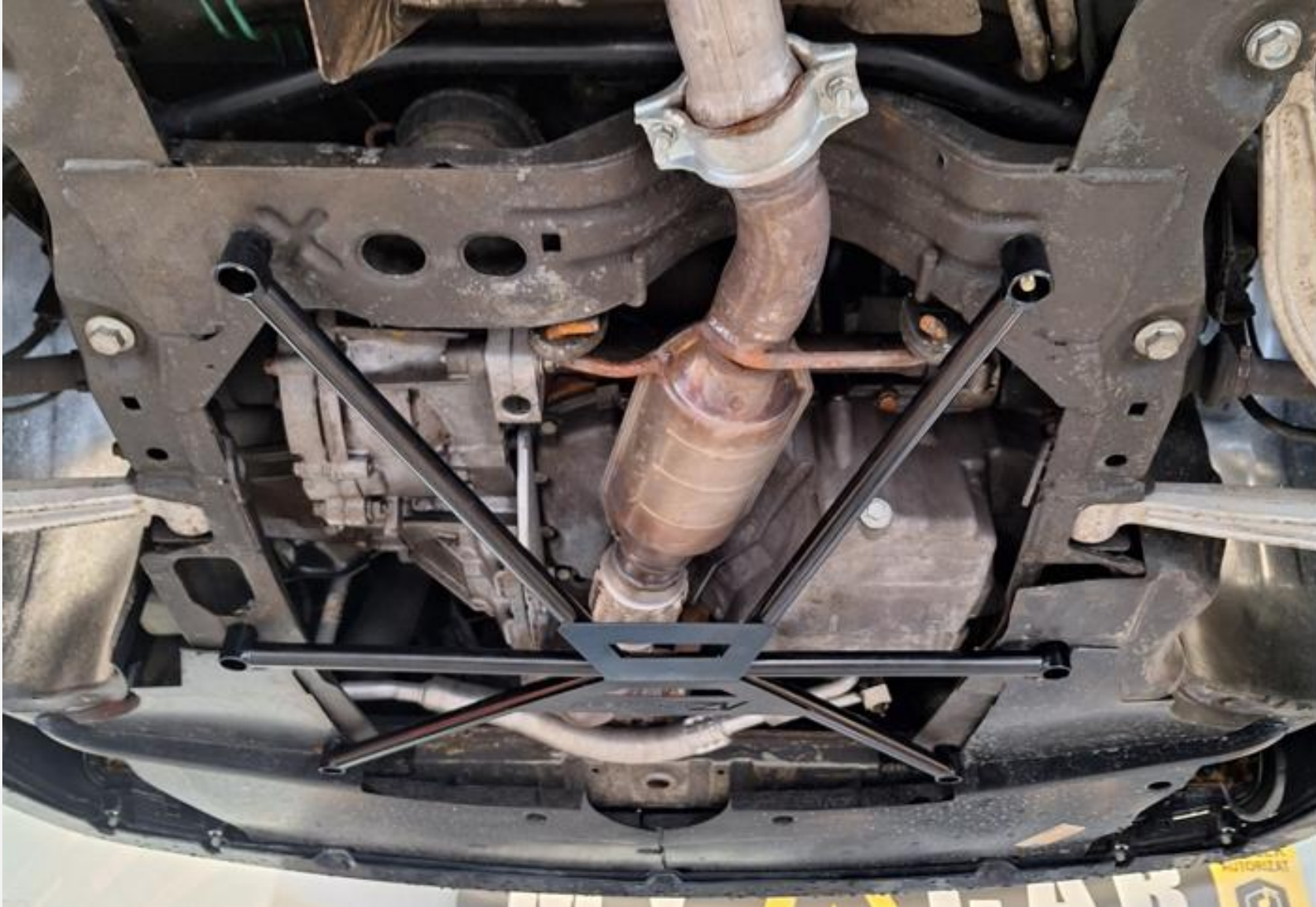
Installed A-Zperformance 6-point subframe brace