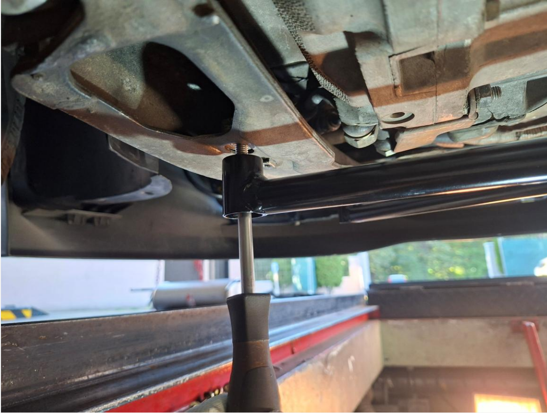
3. Middle Left