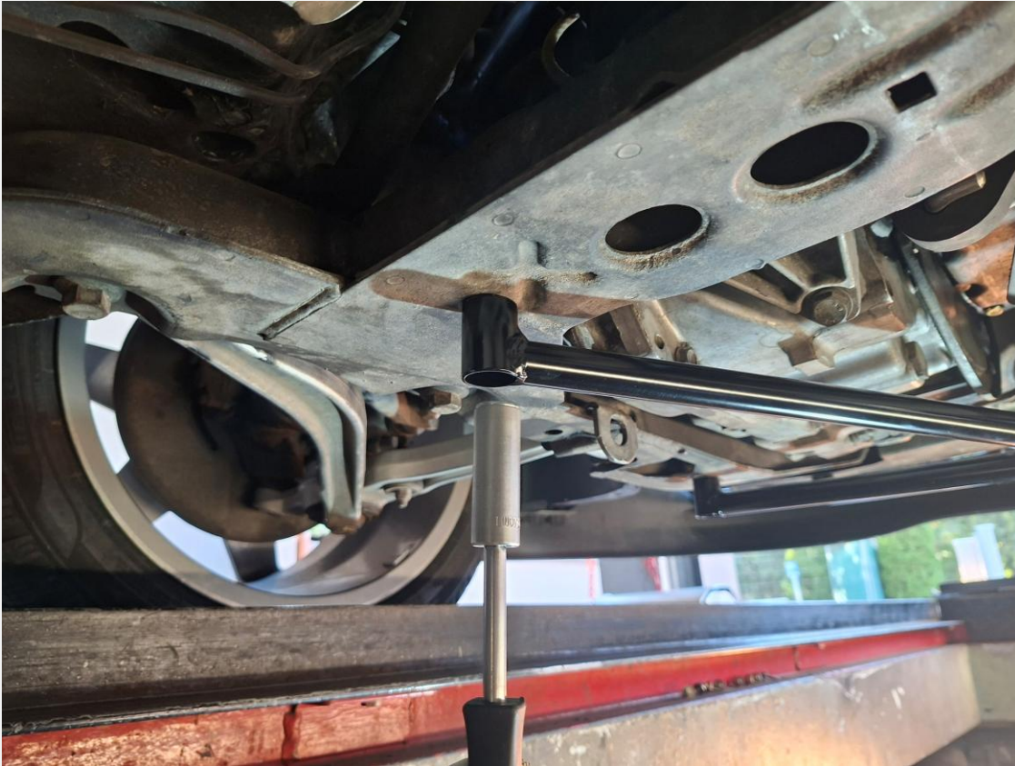
1. Rear Left