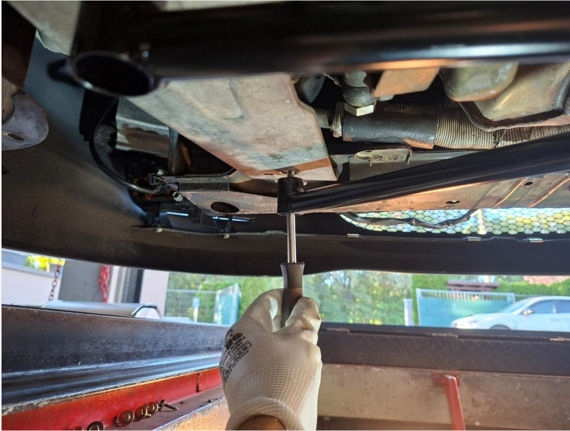
5. Front Left